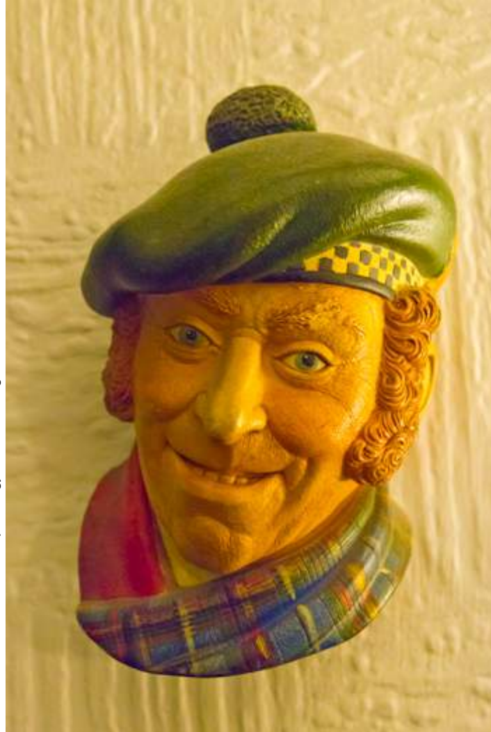
Scotsman: wall fixture. Loch Fyne, Argyll, Western Highlands, Scotland.

BIBLICAL DISCERNMENT - THE MISSING JEWEL OF THE 21ST CENTURY CHURCH!