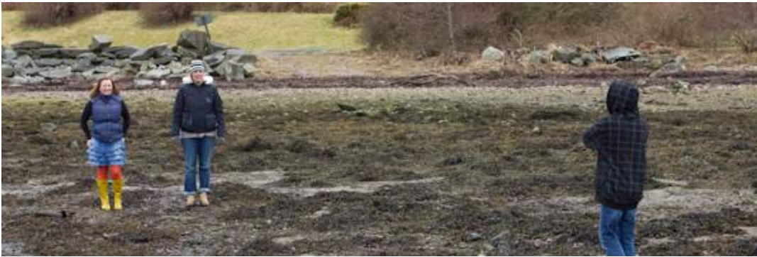
REMEMBERING BELIEVERS: AFTERNOON FELLOWSHIP WALK (Scottish Highlands, 2012)