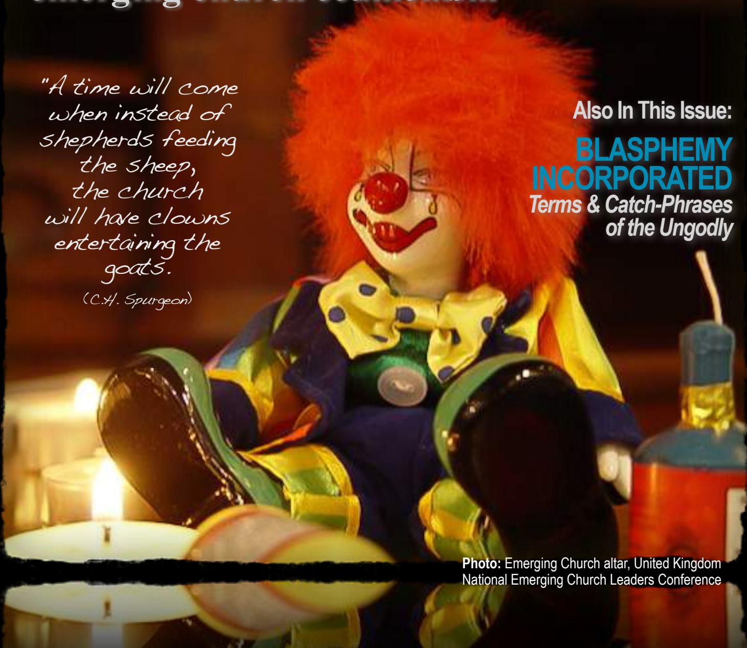
Photo: Emerging Church altar, United Kingdom National Emerging Church Leaders Conference

For the time will come when they will not endure sound doctrine; but after their own lusts shall they heap to themselves teachers, having itching ears; And they shall turn away their ears from the truth, and shall be turned unto fables. - 2 Tim 4:3-4